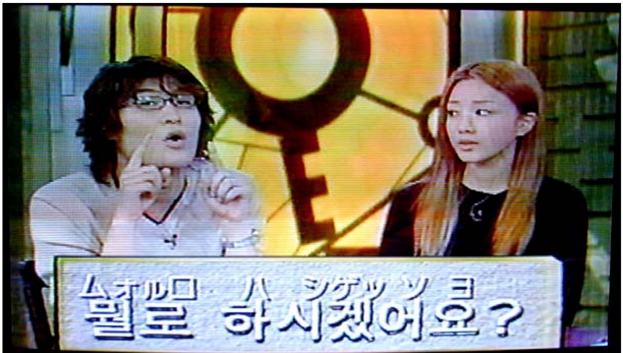
Korean language class on TV