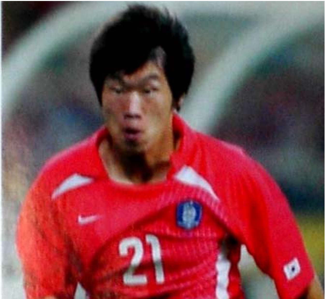
Korean Players in Japan (PARK Ji Sung)