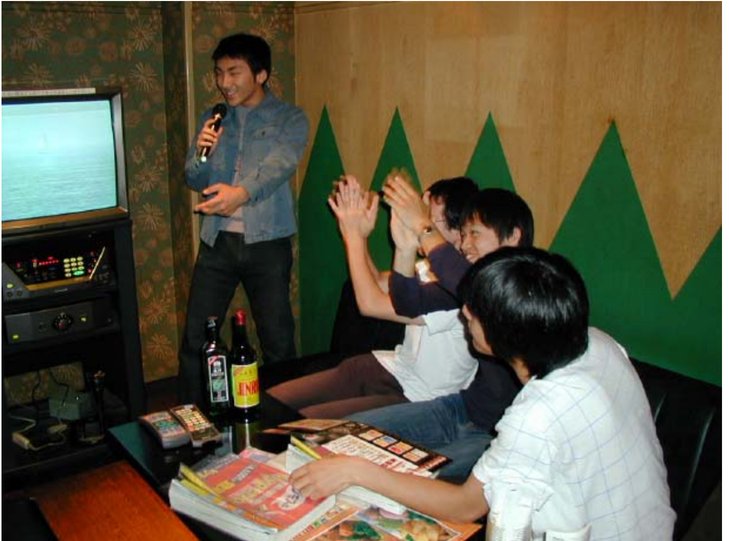
Singing at karaoke