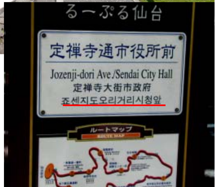
Loop bus stop