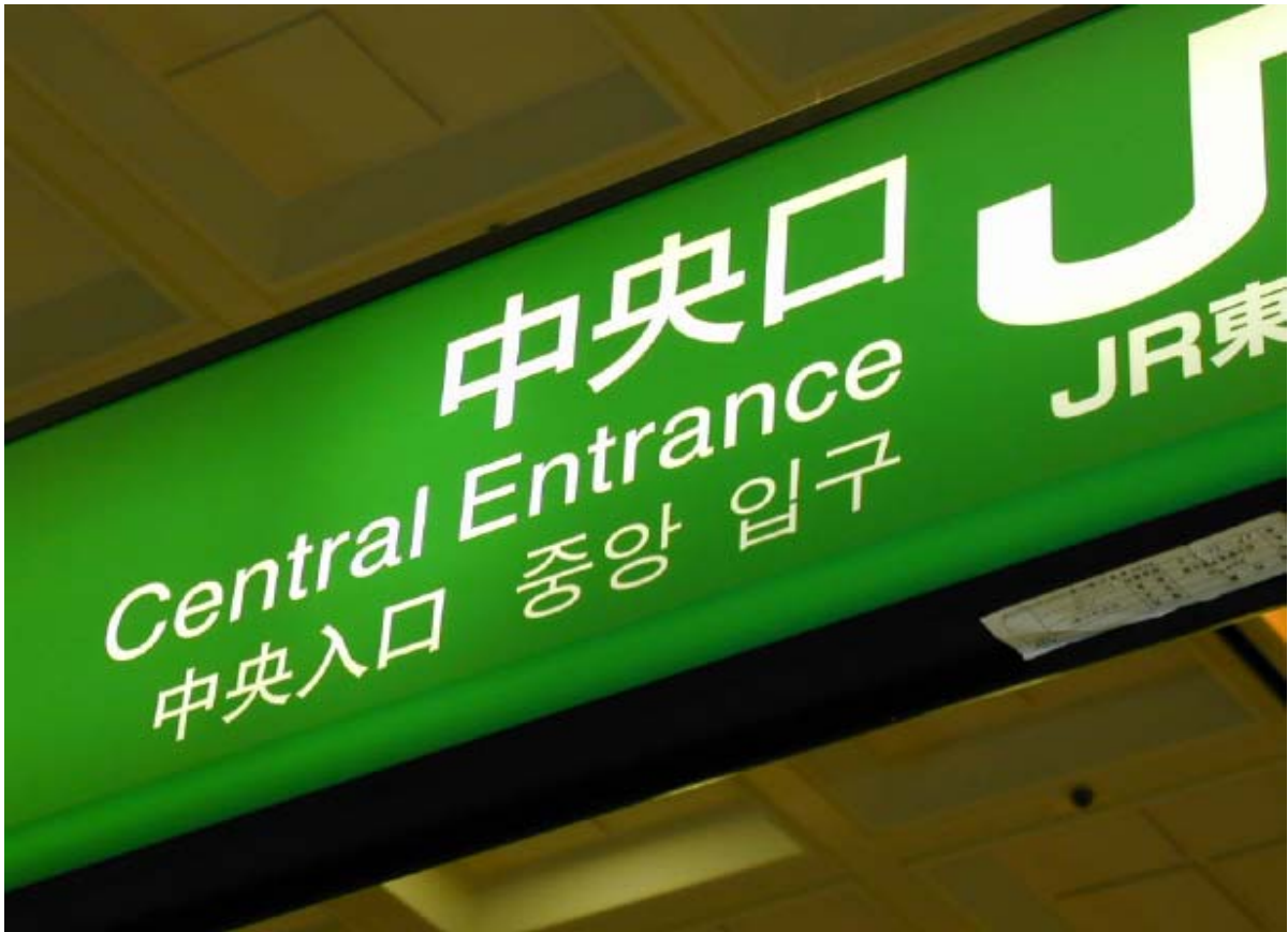
At Sendai station